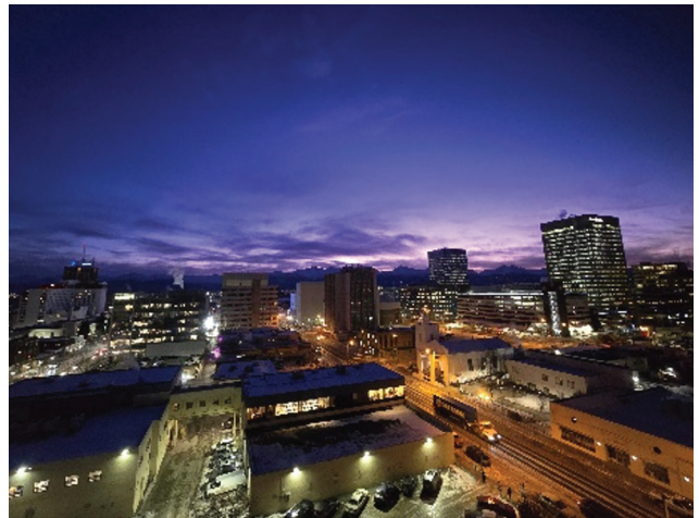
View of Downtown Anchorage from the Hotel Captain Cook.