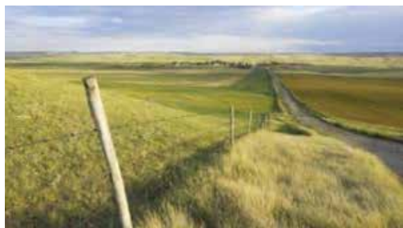
Typical landscape in Southern Alberta, where Lana lives.