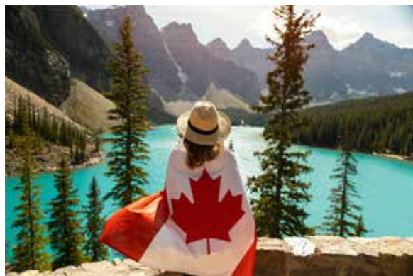
Moraine Lake – it is a glacier fed lake in Alberta. This lake is near Banff if anyone was able to travel to this while attending the Calgary conference.