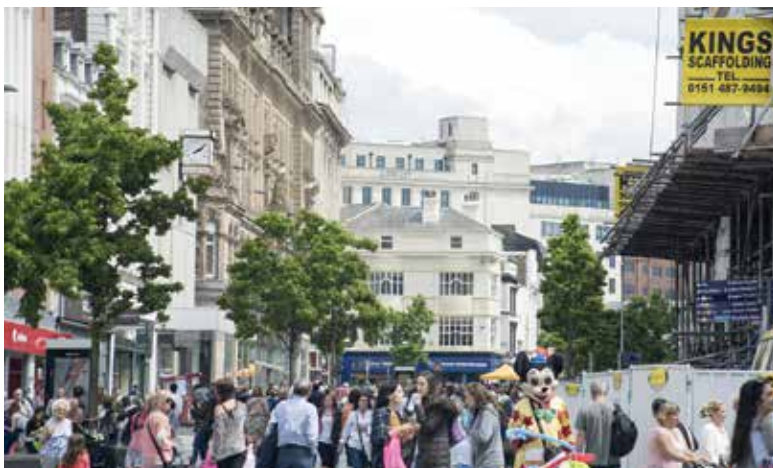
Pedestrian Mall in Liverpool shopping area