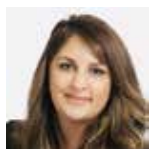
Past IIMC Region X Director Wins Quill Award... Continued from page 8

Happy Municipal Clerks Week! Don't forget to share your photos with IIMC!