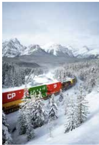
Train as it makes its way through the Rocky Mountains.