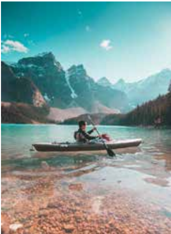
Kayaking in the Canadian Rockies.