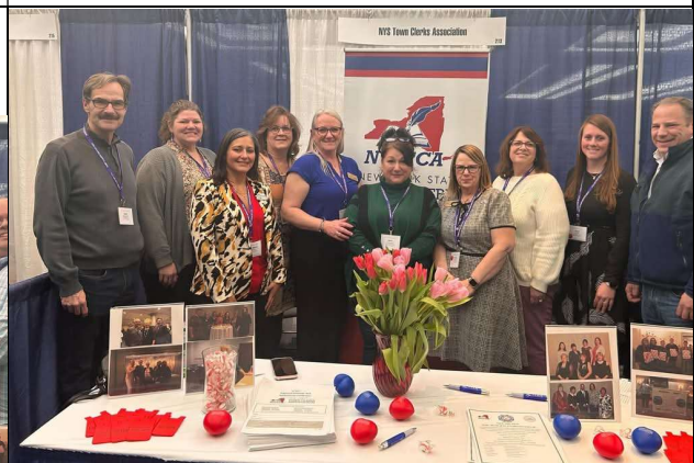
NYSTCA board members and district directors