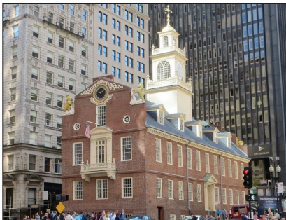
The Old North Church

Lunch On Your Own: Quincy Marketplace and Faneuil Hall