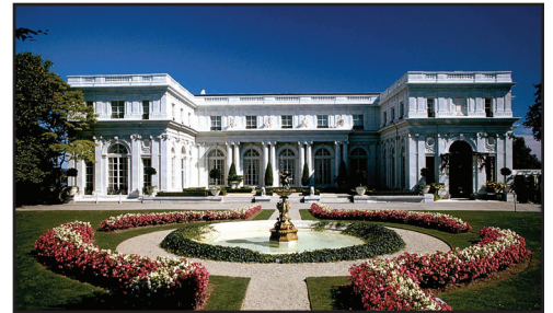
Newport Rosecliff Mansion