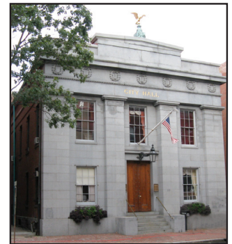
Salem City Hall

Dinner this evening is served at a shore-side restaurant. Savor the flavors of New England fare served in a relaxed atmosphere and enjoy magnificent waterfront views of Salem Harbor.