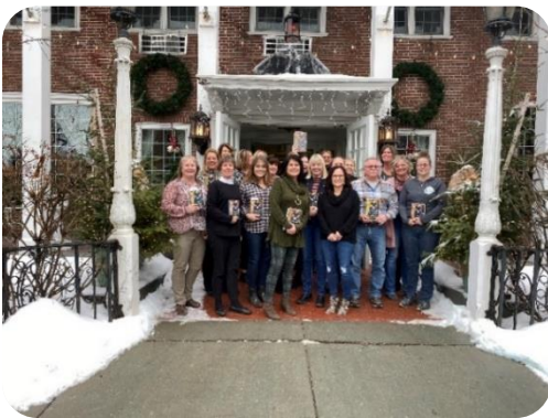
Lowell Inn Stillwater, Minnesota January 24, 2020