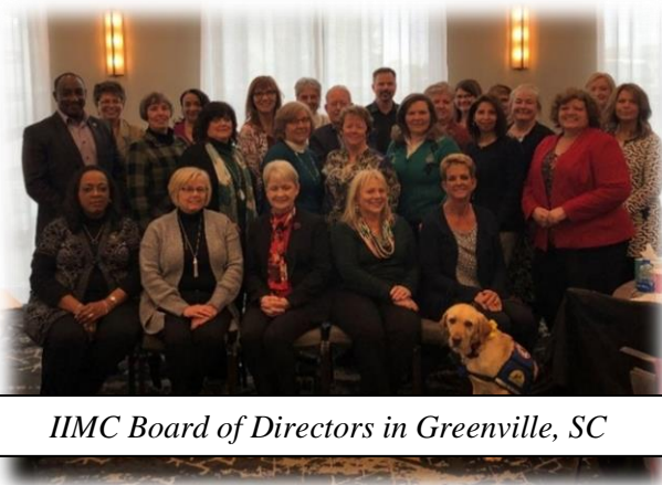
IIMC Board of Directors in Greenville, SC

In November we attend the IIMC Board mid-year meeting in Greenville, South Carolina. We concluded working on Strategic Planning to better serve and reach clerks into the future. More updates were provided in the news release and at the January Region Meeting (see below).